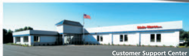
Customer Support Center

We are world leaders in cold drink vending machines and we are a division of Maytag Corporation a leading producer of home and commercial appliances.